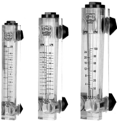
■ Fix by fitting